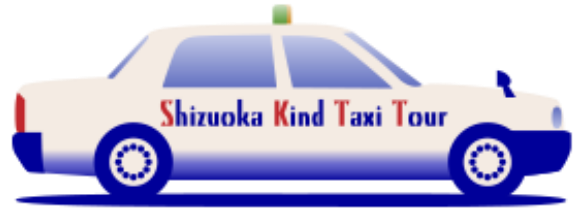
Chartered Jumbo Taxi , Regular Taxi