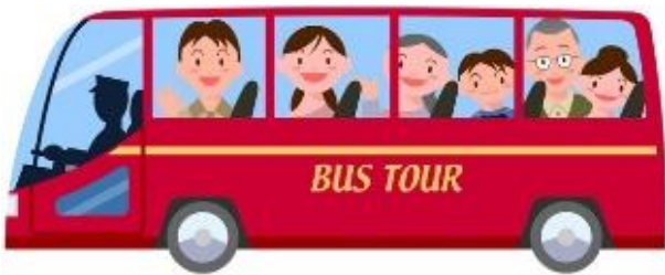
Micro, Medium, Large Bus