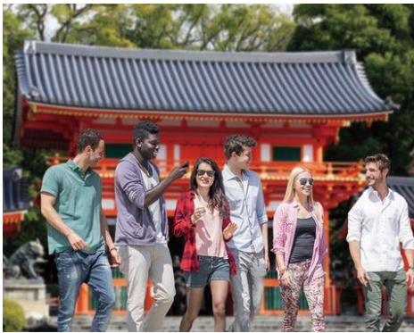
Arrange local tours