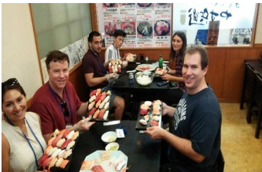
Sushi making experience Green Tea Farm experience