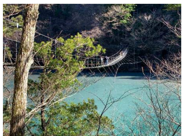
Yume no Tsuribashi suspension bridge at Sumatakyo