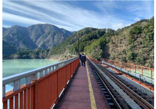
Okuoi kojo Station (=Station on the lake) by abt train