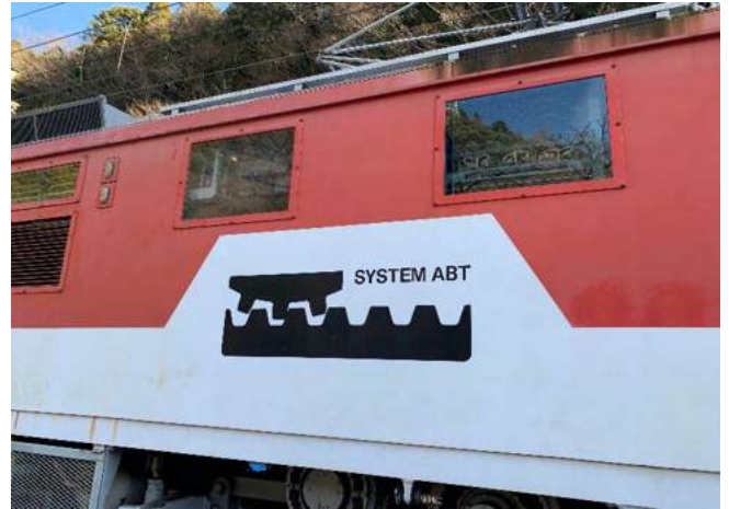
Steam Locomotive & Abt Train of Oigawa Railway